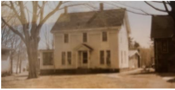
Parsonage was located between church and current Unionville Museum.