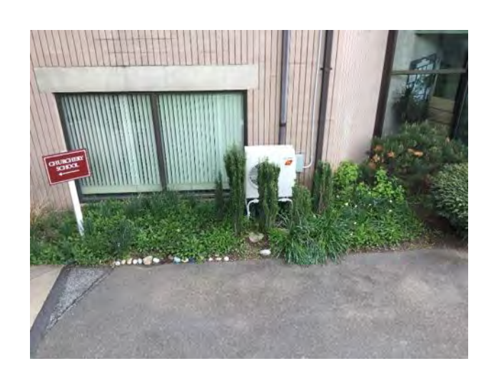
Remove weeds. transplant, irises and miscellaneous to the space for ground cover

Again, the thought is reducing the footprint, reducing the work, maintaining a visual appeal and maintaining the purpose.