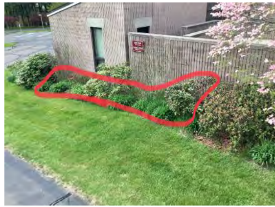
Removal of circled plants. The tree and plants to the right will remain as a nice visual entrance to the sanctuary.