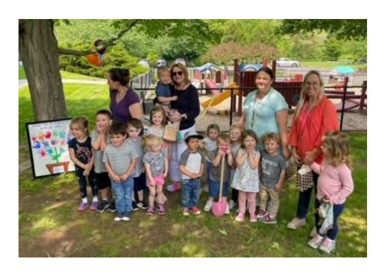
2 Yr. Old Picnic