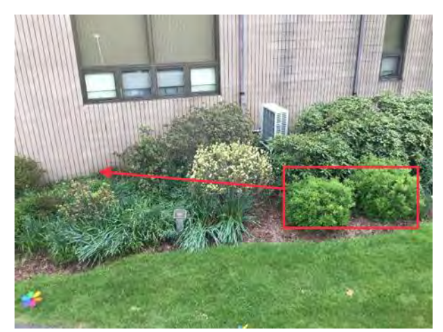
Two bushes in red box to be moved to location against wall

Green circled plants would be moved to the space in front of the wall. Creating a continuous bed. The ground in front of balance of the plants would be turned into grass. Ground cover, irises could be moved to the Churchery school bed. The early flowers could be left to grow through the grass. These flowers bloom before the grass needs cutting